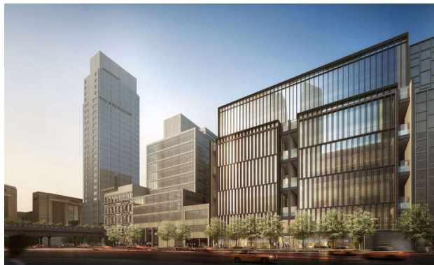
All images of Soori High Line #7A