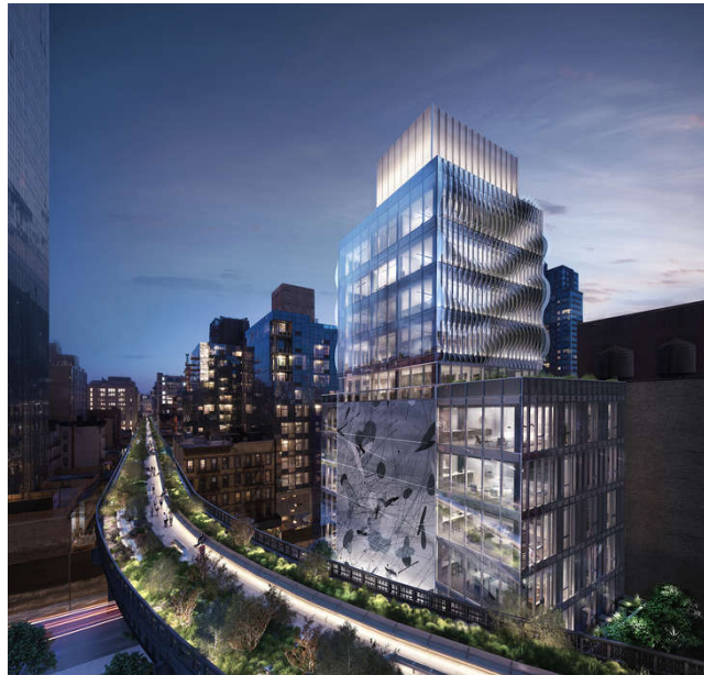
All images of Five One Five via CORE

Five One Five, 515 West 29th Street Developed by Forum Absolute Capital Partners, Design by Soo K. Chan 4 Available Units from $3.975 Million